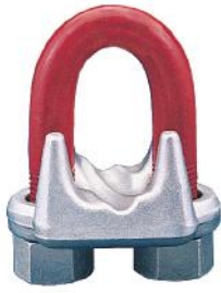
G-450 Red U-Bolt® Clip