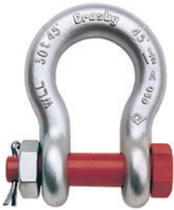
G-2140 / S-2140

G-2140 meets the performance requirements of Federal Specification RR-C-271G, Type IVA, Grade B, Class 3, except for those provisions required of the contractor. For additional information, see page 452.