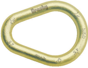
A-341 Alloy Pear Shaped Links