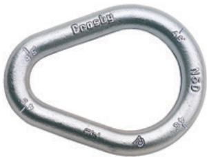
G-341 / S-341 Weldless Sling Link

*Based on single leg sling (in-line load), or resultant load on multiple legs with an included angle less than or equal to 120°. Minimum Ultimate load is 5 times the Working Load Limit. †† Welded Link.