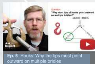
Ep. 5 Hooks: Why the tips must point outward on multiple bridles