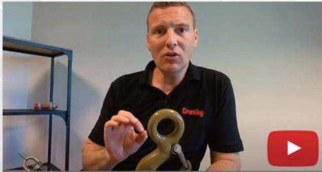
Ep. 21 Grinding and wear allowance on rigging hardware

4.5:1 Design Factor. Maximum allowable proof load is 2.5 times Working Load Limit. *Deformation indicators.