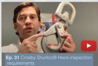
Ep. 31 Crosby Shurlock® Hook inspection requirements